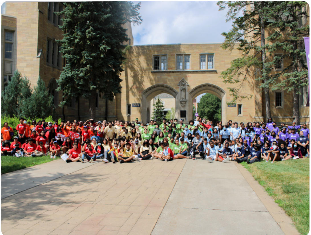
Breakthrough students at the college visit to the University of St. Thomas