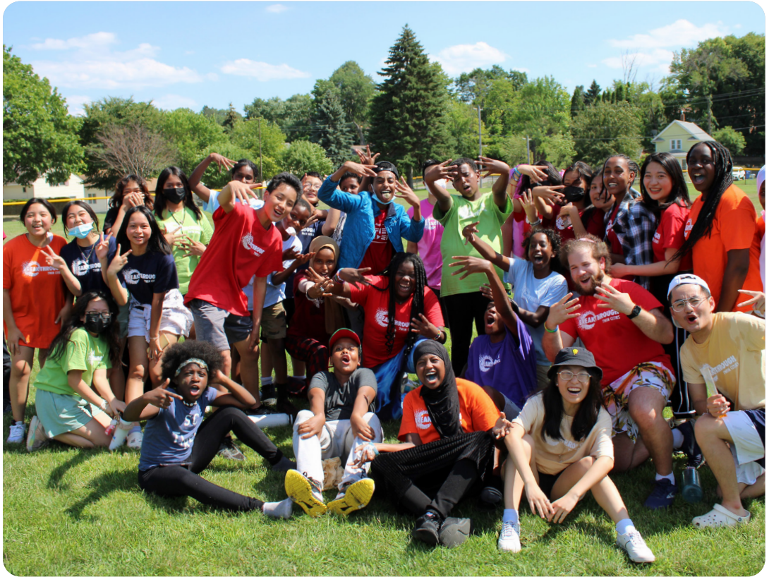
Celebrating after spirit week!